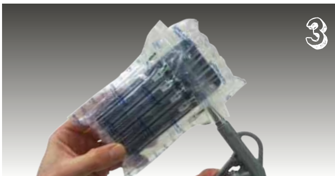
The Emba-Vento pack is completely inflated ...