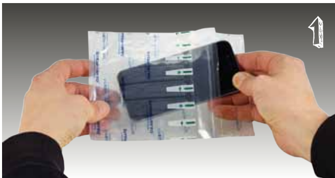
The product is inserted into the pack ...

Emba-Vento® is suitable for a vast variety of different products.