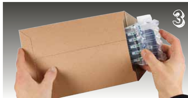
Product is completely protected and ready for dispatch!